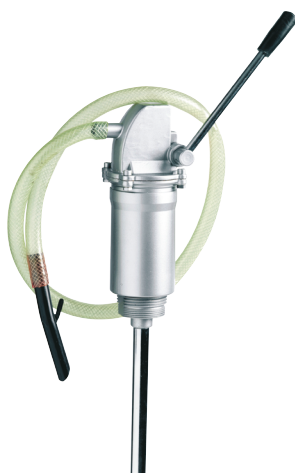
PISTON HAND PUMP