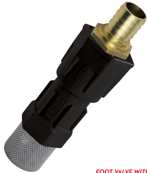
FOOT VALVE WITH FILTER